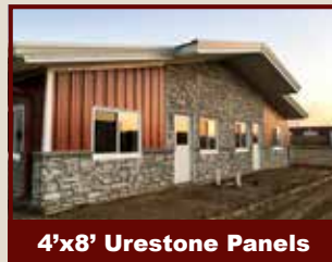
4'x8' Urestone Panels