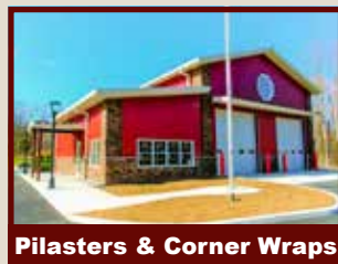
Pilasters & Corner Wraps