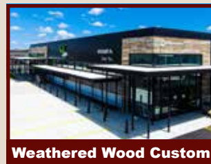
Weathered Wood Custom