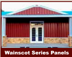
Wainscot Series Panels

Custom capabilities at our plant ensure that we can provide the necessary architectural elements for nearly any job. We strive to provide unparalleled service to customers with projects of virtually any size. We make this possible due to our integrated solution that shortens construction cycle times, reduces construction costs, and increases build quality.