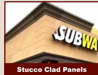
Stucco Clad Panels